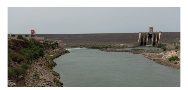
Water management in Sudan: the Upper Atbara Dam

To initiate measures against a variety of extreme events at an early stage, it is required to combine seasonal forecasts covering several months with those of shorter horizons from two to six weeks in advance. Within the joint project SPS-Blue Nile, participants from science, politics and water management are therefore developing methods to